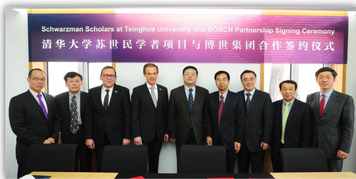
Schwarzman Scholars – Bosch Partnership Signing Ceremony, March 27, 2014

Fundraising efforts continue to be highly active, and the program aims to reach its campaign goal by December 2015.