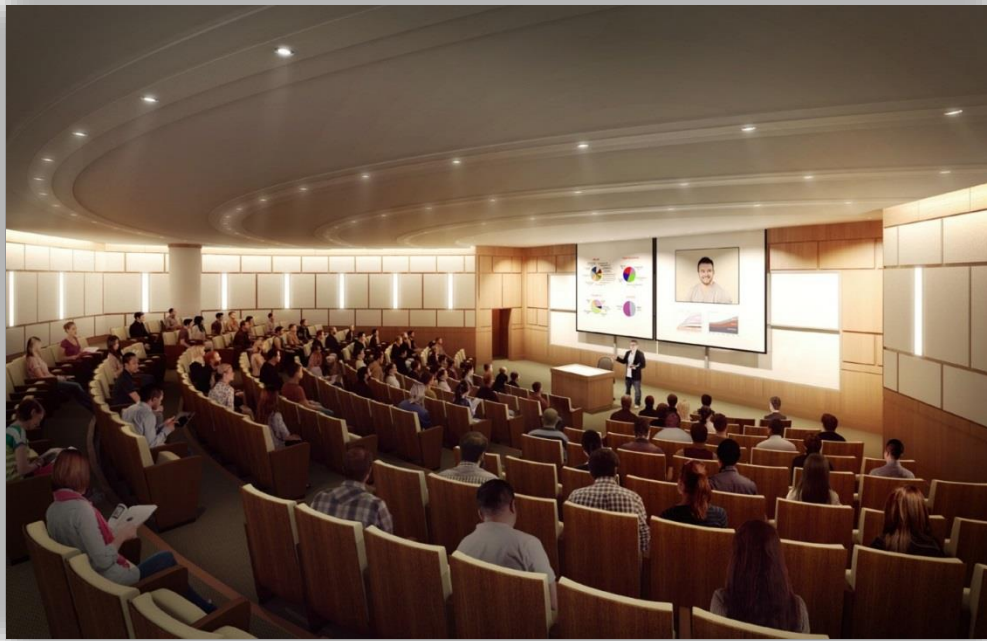
Rendering of a Classroom in Schwarzman College

Each year the program will enroll 200 outstanding students from around the world to study and gain unrivaled exposure to the world's most populous nation. The composition of each class will be 45% from the U.S., 20% from China, and 35% from the rest of the world. At the culmination of twelve months, students will be awarded a master's degree by Tsinghua University.