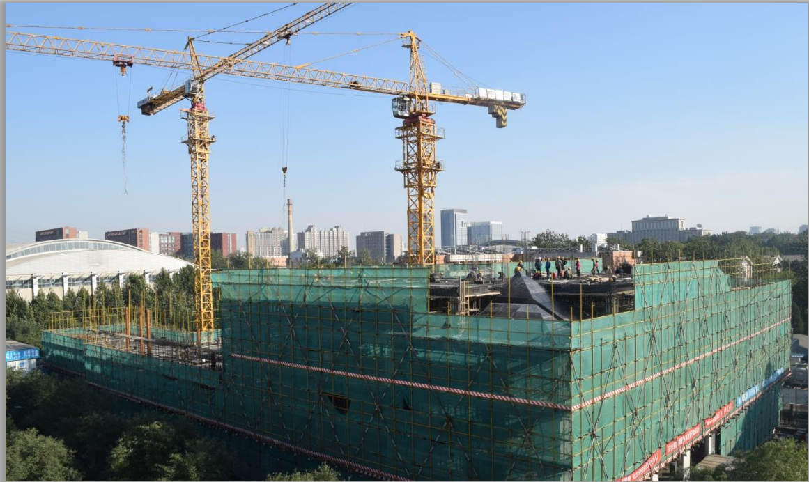
Schwarzman College construction in progress, October 2014

The College, designed by Robert A.M. Stern Associates to recall both the traditional residential colleges at Oxford, Cambridge, Harvard and Yale and the courtyard houses of ancient China, will feature high-performance air and water filtration systems and special food safety procedures and controls.