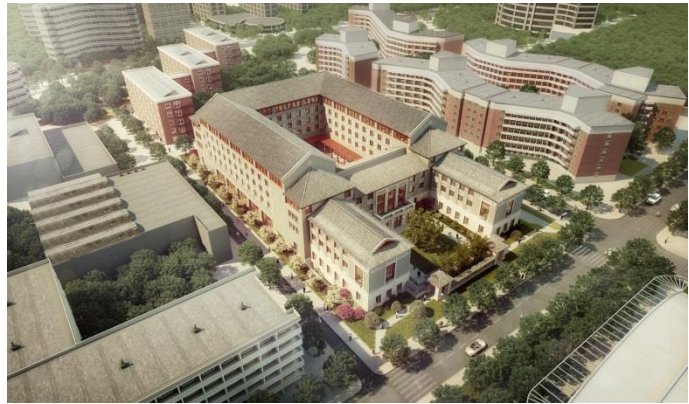
Aerial Rendering of Schwarzman College, due to open in early 2016

As a result of these multifaceted efforts and initiatives, the program is on track towards the inaugural admissions season in April 2015, the completion of the construction of Schwarzman College on Tsinghua University's campus in early 2016, and the matriculation of the first class of Schwarzman Scholars in July 2016.