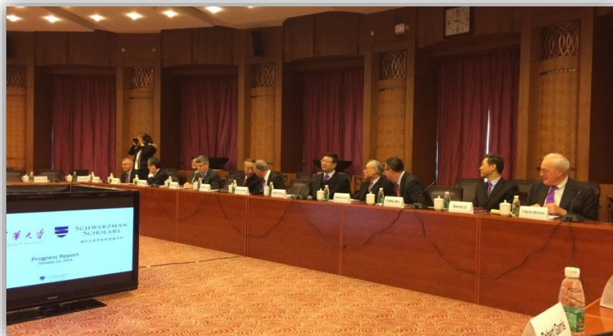
Academic Advisory Council Working Session, Beijing, October 22, 2014