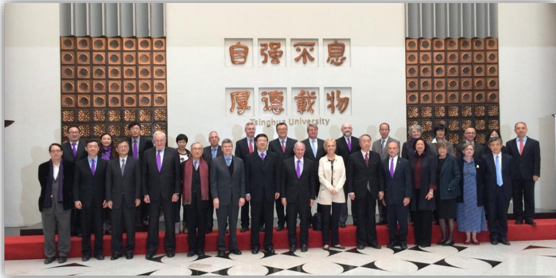
Academic Advisory Council, Schwarzman Scholars Academic Affairs Team and Tsinghua University Faculty and Administrators in Beijing, October 21 and 22, 2014

afford Schwarzman Scholars invaluable insights into how China's dynamic economic and political development is informed by its history, culture, and people.