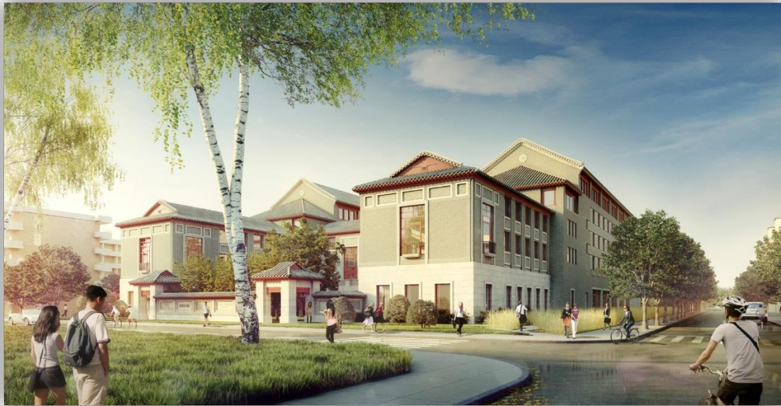
Rendering of Schwarzman College at the street level

The renowned architect, Robert A.M. Stern, Dean of the Yale School of Architecture, has designed a world-class residential and academic center, Schwarzman College. The College will blend the styles of the traditional colleges at Oxford, Cambridge, Harvard and Yale with the courtyard houses of ancient China.