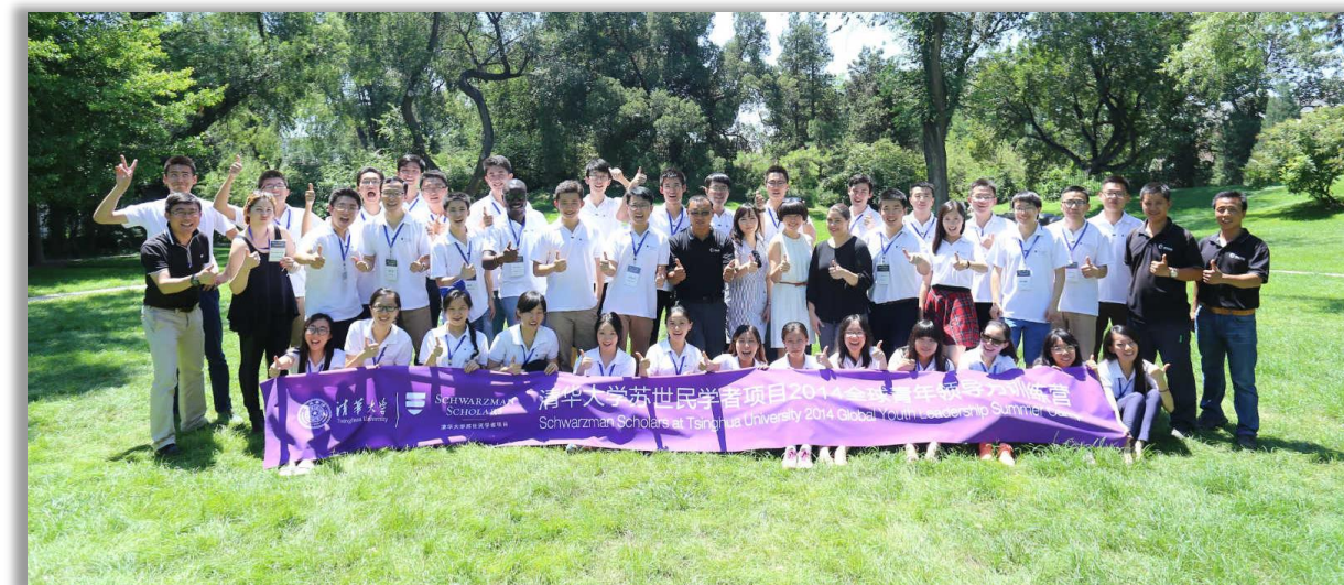
Participants in the first annual Schwarzman Scholars Global Youth Leadership Summer Camp, July 2014

Meanwhile, the Schwarzman Scholars Beijing office also has been focused on raising awareness for the program amongst the Chinese student and academic communities. To this end, the inaugural Schwarzman Scholars Global Youth Leadership Summer Camp was held at Tsinghua University in July. The summer program is an important marketing tool in China that will help the program to inspire interest among the nation's top students and evaluate potential candidates for the program. Over the course of four days, rising seniors from top Chinese universities attended lectures, prepared and delivered team presentations, and participated in a rigorous and engaging program that demonstrates the type of leadership training that students will receive as Schwarzman Scholars.