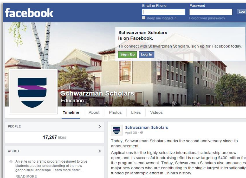
Schwarzman Scholars Facebook page as of June 1, 2015

Meanwhile, the Schwarzman Scholars social media team has been making significant headway expanding the program's virtual presence and outreach. To date, the program has been able to garner over 17,000 followers on Facebook and nearly 14,000 followers on Twitter. Additionally, the program's followers on WeChat, one of the most prolific social media platforms in Asia, have increased by approximately 27% over the past two months.