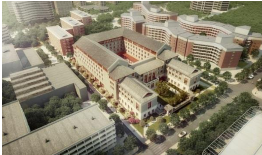
Aerial rendering of Schwarzman College, due to open in early 2016

The Schwarzman Scholars program is most grateful for the generous support of the Boeing Company and looks forward to continuing this meaningful and impactful partnership.