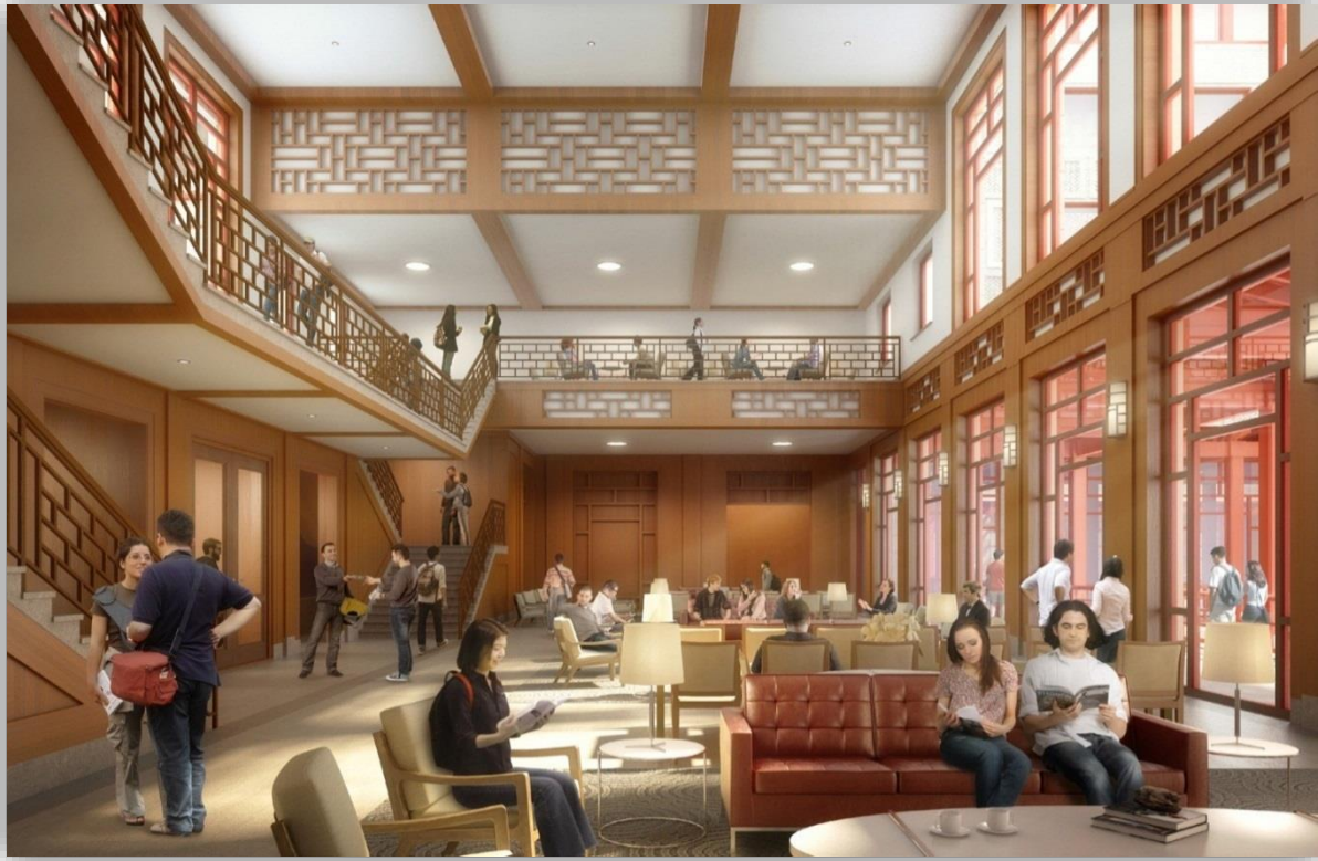
Rendering of the Schwarzman College Student Forum, the social heart of the College