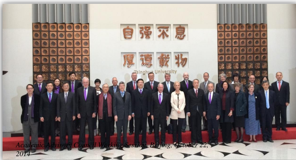
Academic Advisory Council, Schwarzman Scholars Academic Affairs Team and Tsinghua University Faculty and Administrators in Beijing, October 21 and 22, 2014

Tremendous focus has also been placed on developing the extracurricular elements of the program. During their year in Beijing, students will be given the unique opportunity to have direct and open interaction with visiting scholars, public officials, industry leaders, artists and luminaries. Outside of the classroom, students will undertake numerous cultural excursions throughout China, be paired with peers at Tsinghua University, participate in internships and charitable work, and develop relationships with mentors from the local community. This will afford Schwarzman Scholars invaluable insights into how China's dynamic economic and political development is informed by its history, culture, and people.