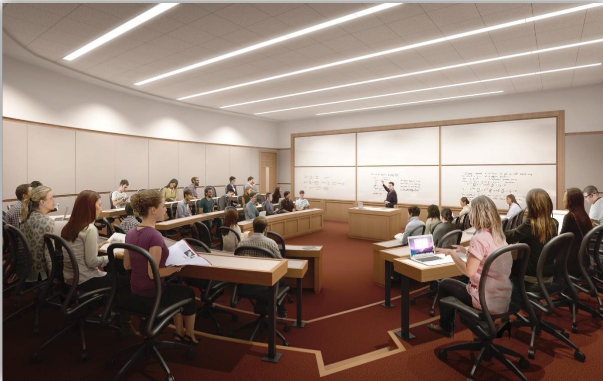
Rendering of a Classroom in Schwarzman College

The Economics and Business Program will emphasize the study of the theory and tools of economics and finance to prepare scholars for careers in international finance, public policy, business or economic development in the public and private sectors. Scholars will obtain a firm foundation in the functioning of the international economic system, with a particular focus on China. Coursework in international