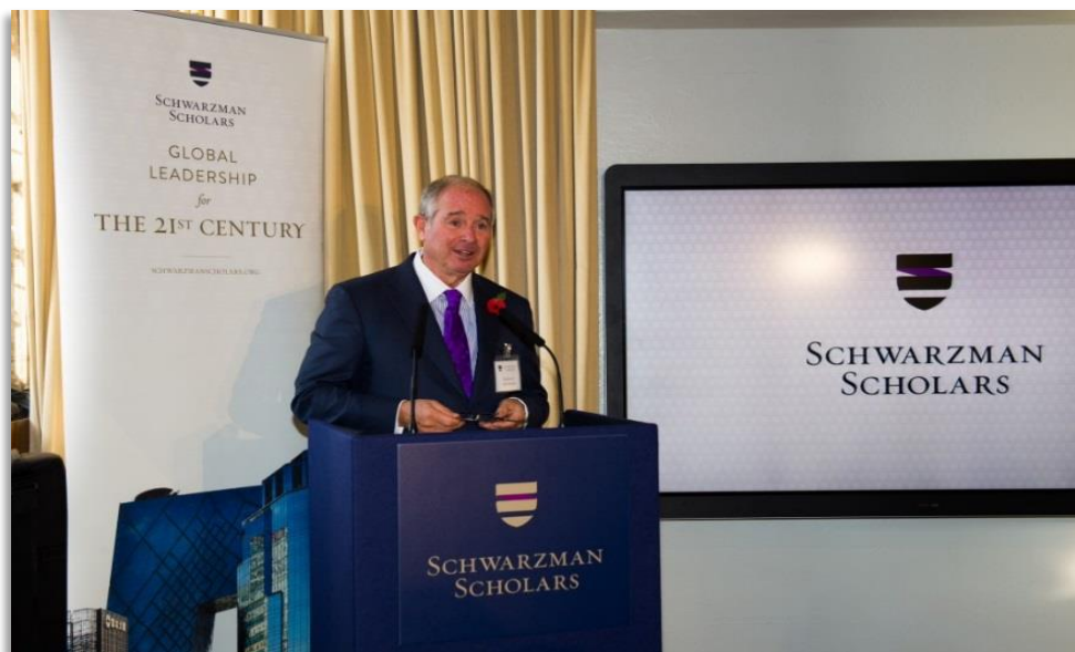
Schwarzman Scholars Founder Stephen A. Schwarzman speaks at the Schwarzman Scholars Launch Event in London on November 10, 2014