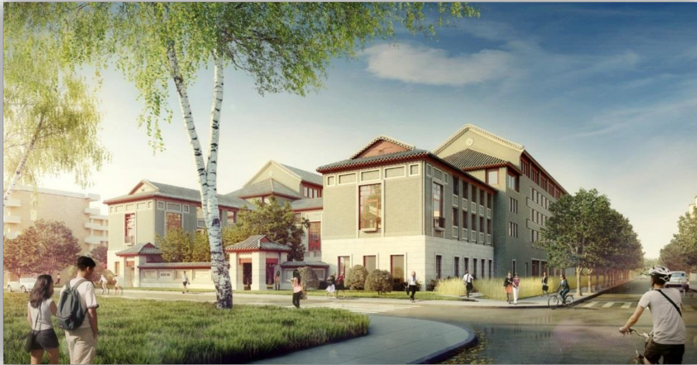
Rendering of Schwarzman College at the street level

The renowned architect, Robert A.M. Stern, Dean of the Yale School of Architecture, has designed a world-class residential and academic center, Schwarzman College. The College will blend the styles of the traditional colleges at Oxford, Cambridge, Harvard and Yale with the courtyard houses of ancient China.