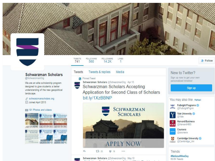
Schwarzman Scholars' Twitter page, May 2016

In January, Schwarzman Scholars produced a new video , which provides viewers with a firsthand account of the interview process as told by Schwarzman Scholars, interviewers, Schwarzman Scholars leadership and Steve Schwarzman. In addition to detailing the interview process, the video highlights the program's mission and its position as a globally important leadership program.