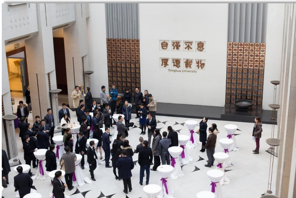
A view from above of candidates, Schwarzman Scholars' leaders and interview panelists mingling at Tsinghua University in Beijing during Schwarzman Scholars inaugural

Fundraising efforts continue to be a critical priority. In addition to ongoing stewardship with existing donors, Steve Schwarzman continues to invest time in reaching out to new potential donors whose support will enable us to reach the ambitious fundraising goal. We are grateful for the early and generous support of Boeing, which enabled us to build a program of which we are enormously proud.