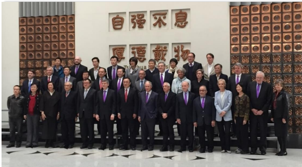
Academic Advisory Council, Schwarzman Scholars Academic Affairs Team and Tsinghua University Faculty and Administrators in Beijing