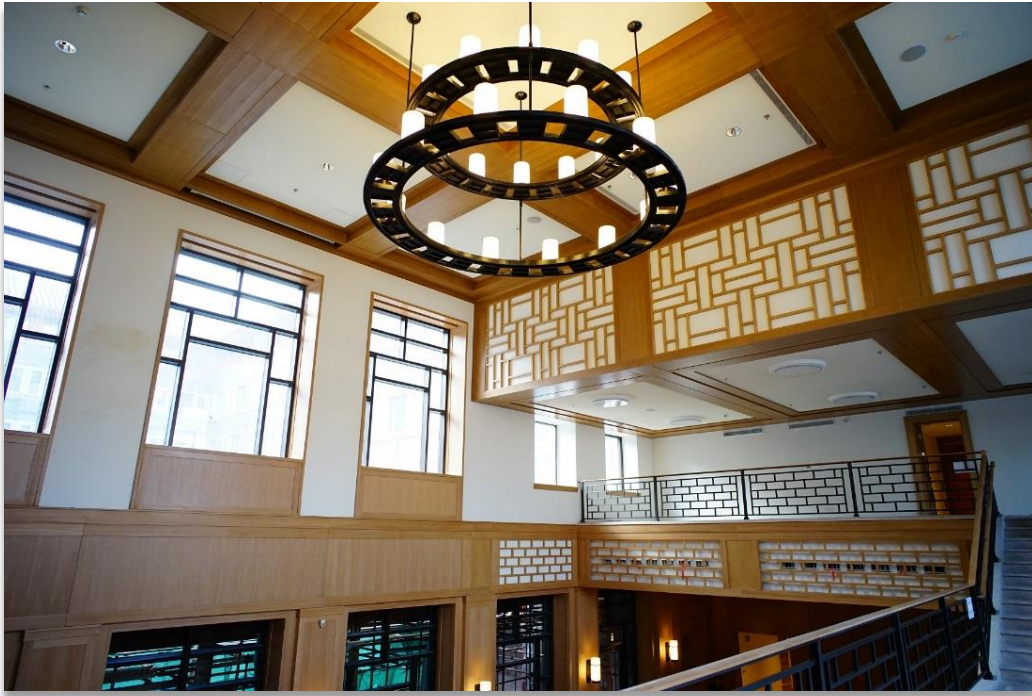
The Forum in Schwarzman College, April 2016

The building will also be home to visiting scholars and dignitaries, and the students will have extraordinary opportunities to connect with global thinkers and leaders after class, at mealtime, and after hours. This distinctive arrangement will offer students a chance to imagine their futures by learning about the lives of and share experiences with this Schwarzman Scholars community.