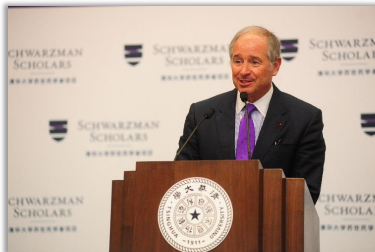
Steve Schwarzman speaks to students at Tsinghua University

The Student Life team will be the point of contact for students and will be responsible for coordination around the alignment of student initiative. It will foster a partnership between Tsinghua University and the Schwarzman Scholars program so that Schwarzman Scholars can enjoy the experience at this globally focused and top-tier university. In addition to on-campus activities, the Student Life team will establish internship and mentorship opportunities with the scholars and leading members of the Chinese business, academic and government communities, and help prepare students for professional experiences upon their graduation.