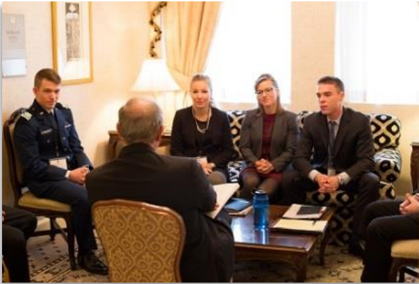
Steve Schwarzman speaking with candidates in New York City, November 2015

In December 2015, 116 candidates from around the world were selected to be a part of the inaugural class of Schwarzman Scholars. 111 candidates accepted the offer, giving the program a 94% yield on admit offers made. The first class of Schwarzman Scholars will matriculate in August.