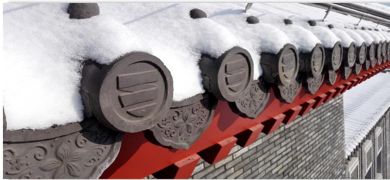
Details of Schwarzman College, January 2016

The building will also be home to visiting scholars and dignitaries, and the students will have extraordinary opportunities to connect with global thinkers and leaders after class, at mealtime, and after hours. This distinctive arrangement will offer students a chance to imagine their futures by learning about the lives of and share experiences with this Schwarzman Scholars community.