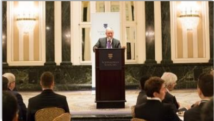
Stephen A. Schwarzman speaks to candidates and interview panelists at New York City's Waldorf Astoria hotel during Schwarzman Scholars' inaugural candidate selection event, November 2015

With the inaugural class of Schwarzman Scholars arriving at Schwarzman College in August of this year, Schwarzman Scholars is finalizing the academic curriculum, confirming a faculty from around the globe and China to mentor and teach, and refining a student life program to deepen the overall campus experience of the Schwarzman Scholars. It has been exciting to watch as architectural renderings of Schwarzman College come to life. Finally, progress continues toward meeting an increased and ambitious fundraising goal that will build an endowment to sustain the program in perpetuity.