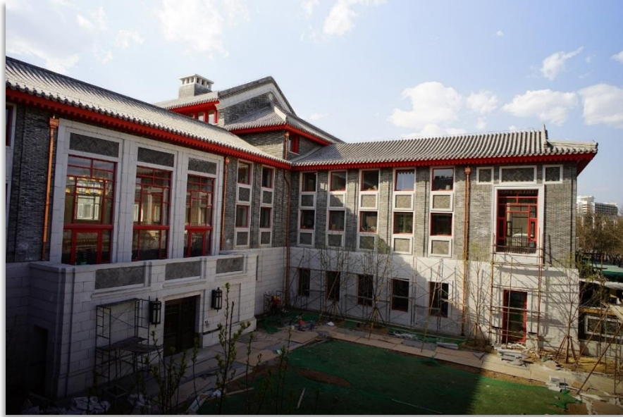
Schwarzman College, April 2016

The renowned architect, Robert A.M. Stern, Dean of the Yale School of Architecture, has designed a world-class residential and academic center, Schwarzman College. The College will blend the styles of the traditional colleges at Oxford, Cambridge, Harvard and Yale with the courtyard houses of ancient China.